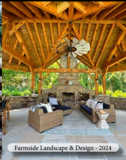
Farmside Landscape & Design - 2024