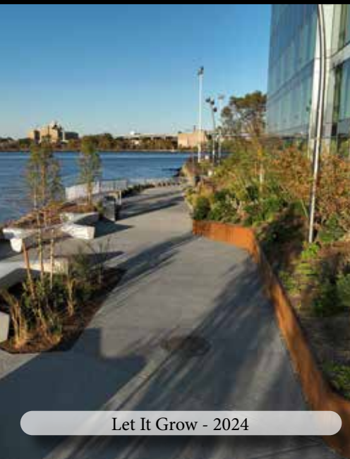
Let It Grow - 2024