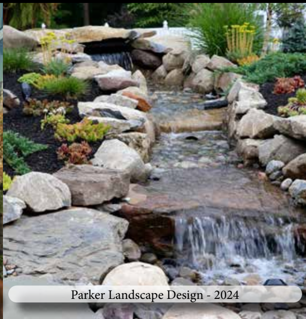
Parker Landscape Design - 2024