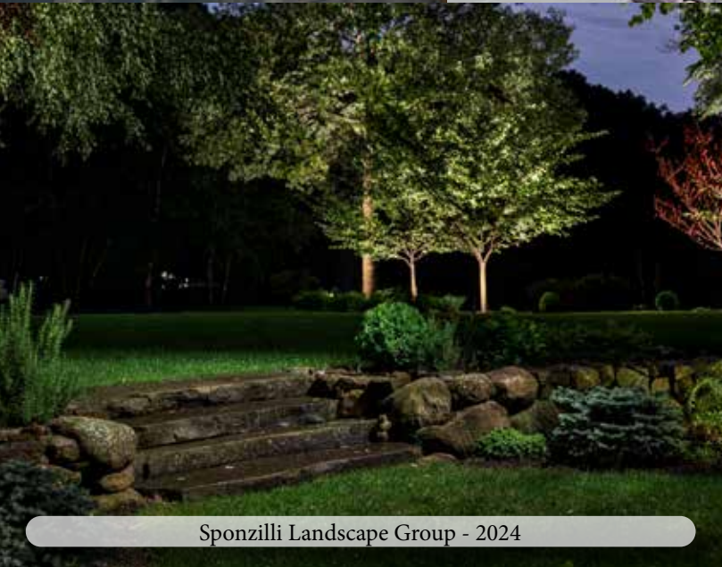
Sponzilli Landscape Group - 2024