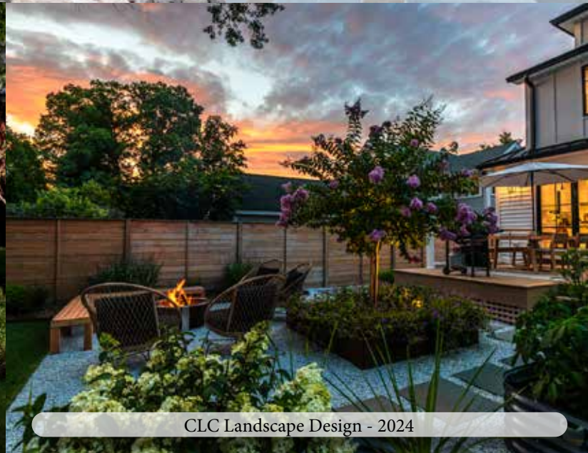
CLC Landscape Design - 2024